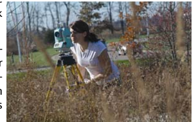
The surveying lab provides great field and teamwork skills.