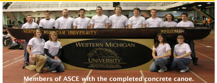
Members of ASCE with the completed concrete canoe.

As a member of these organizations, a student can join in competitions and go to conferences around the state. It is a great