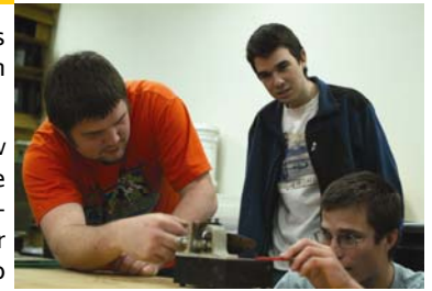
Students performing a soil mechanics lab.

The main lab used by all engineering students is the computer lab. It is updated with the newest software programs, which are needed for student projects and assignments.