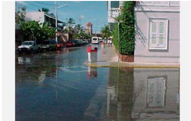
Population centers at low elevations like Florida's Key West are vulnerable to sea-level rise. Credit and Larger Version