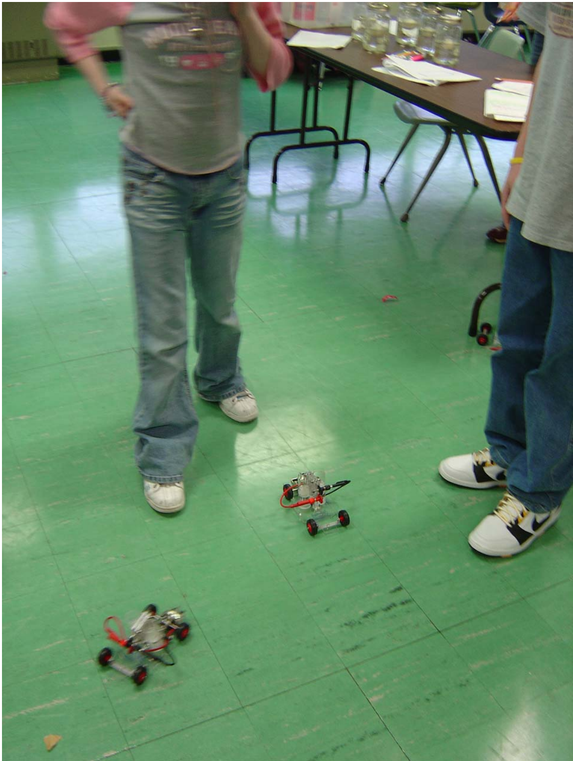
Cars Powered by Solar Cells Are Off and Running