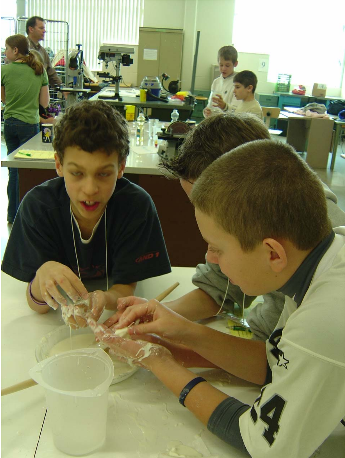
“Goo” Experiments during Engineering Week at WMU for Middle School Students