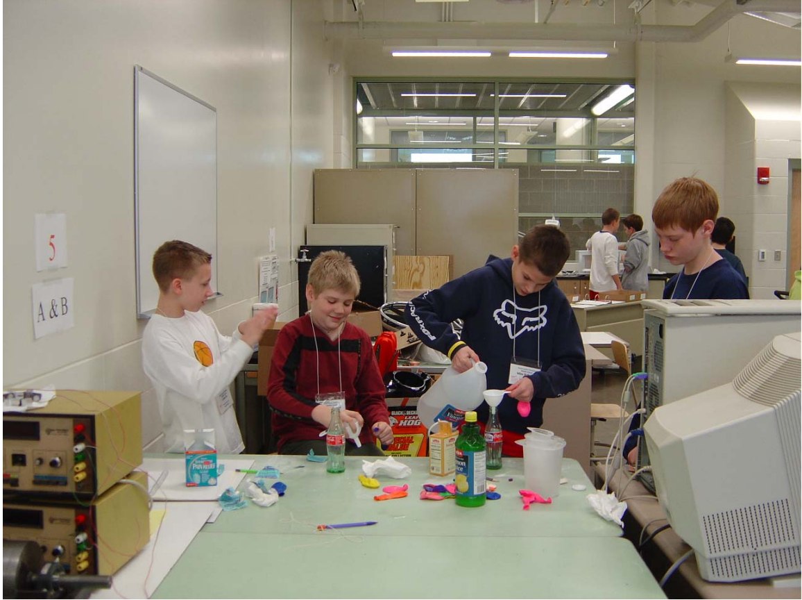
Phase Change Experiments during Engineering Week at WMU for Middle School Students