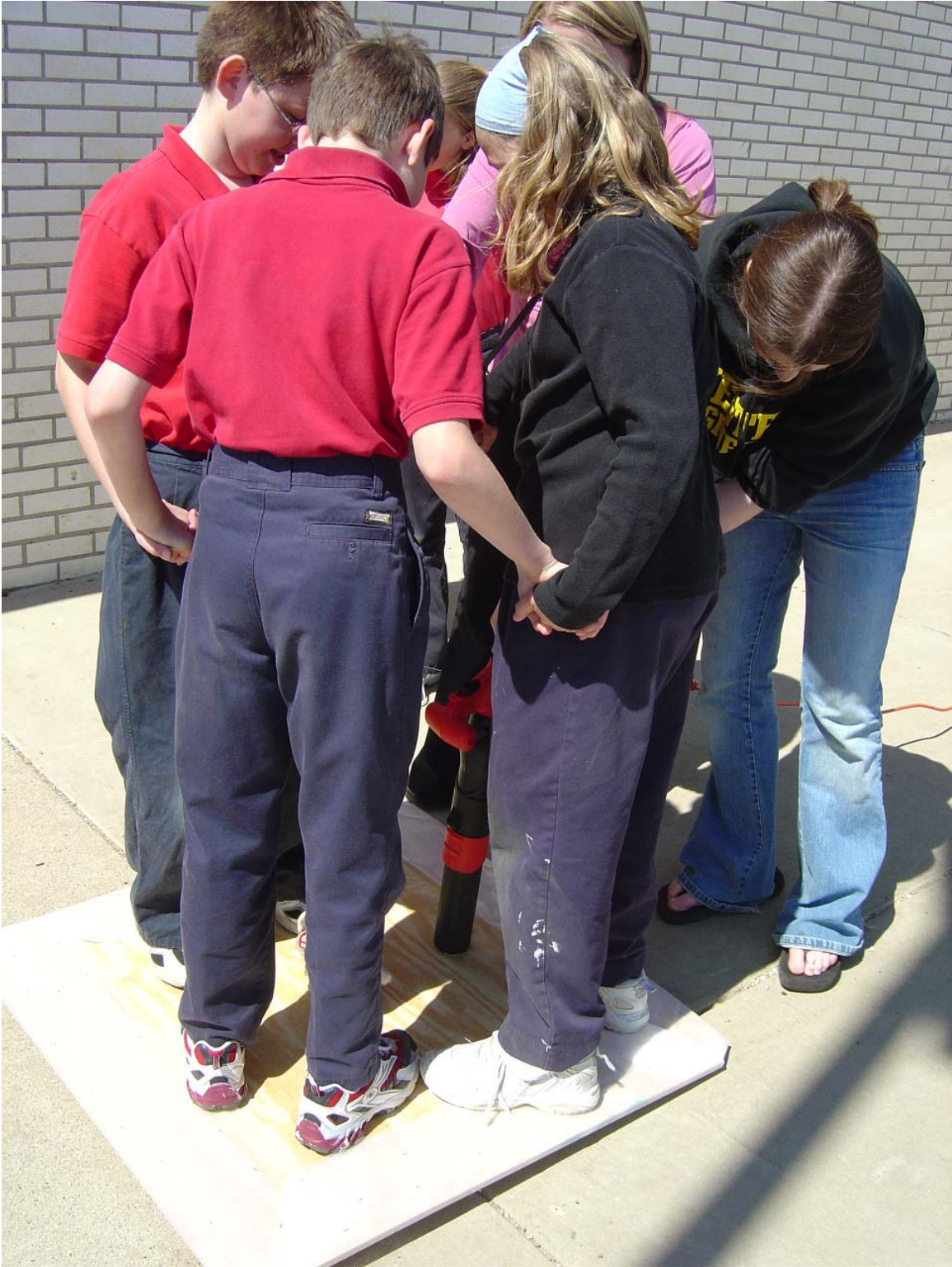
Using the Student Designed Hovercraft to Levitate 4 th Grade Students