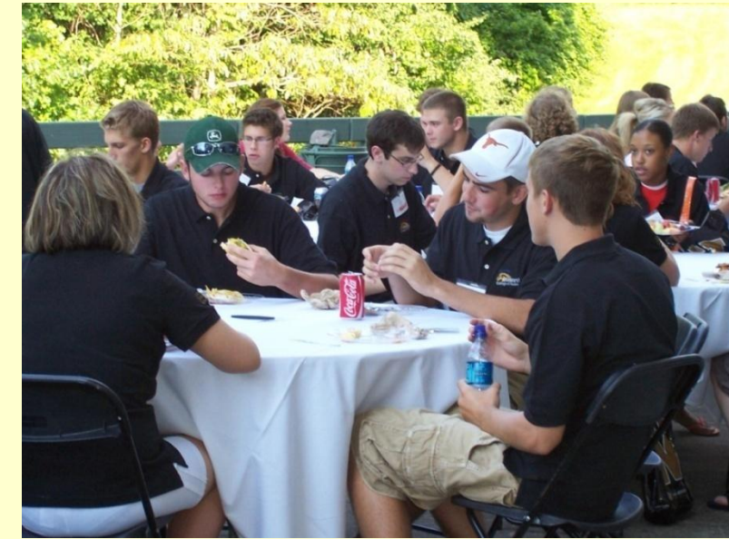
Photos from the Cohort Welcome Barbeque Fall 2007