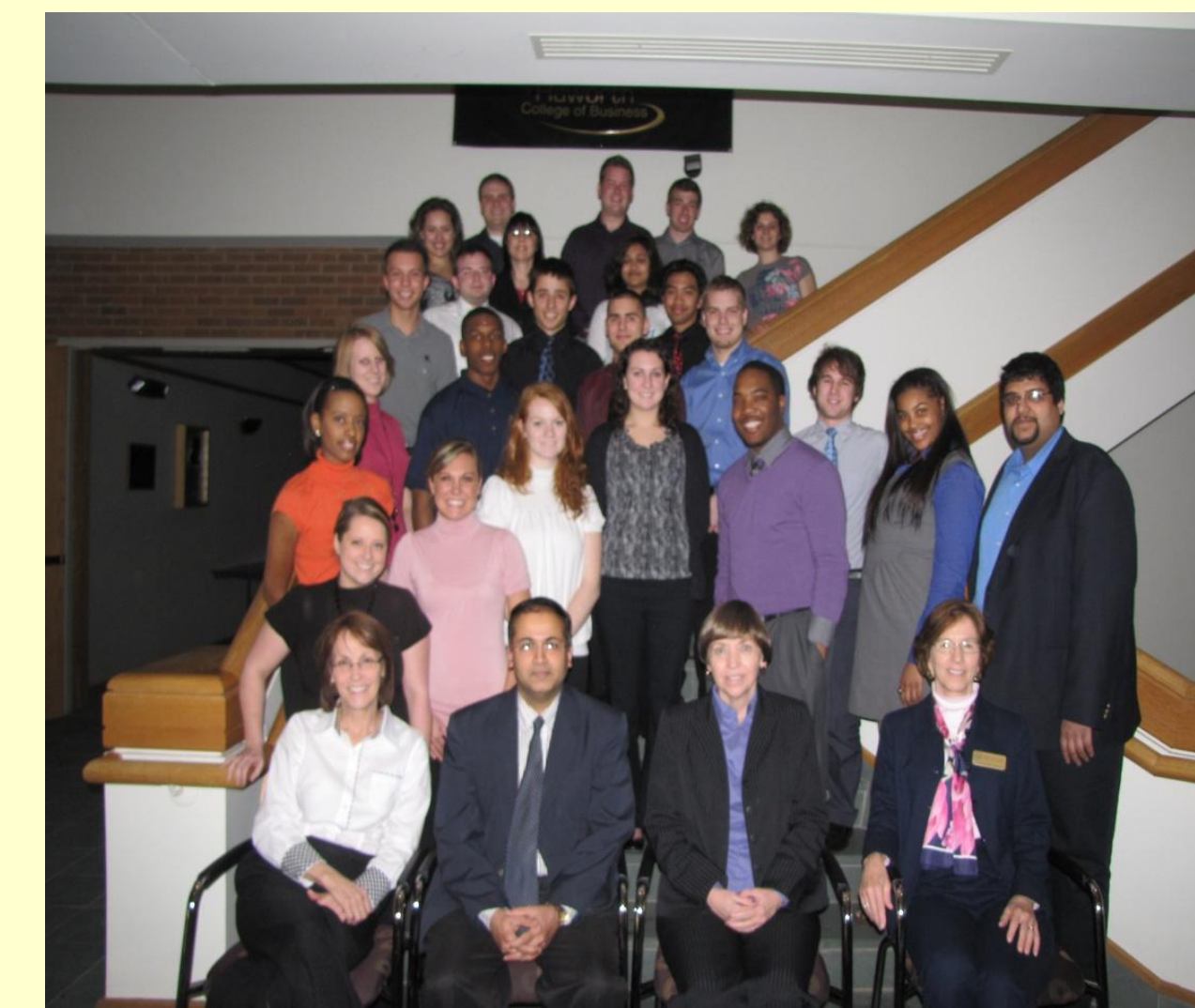
SLAB members and advisors March 2010

Vision: To be recognized as the ideal leadership organization that exemplifies the values and qualities that lead both the individual and the college toward success.