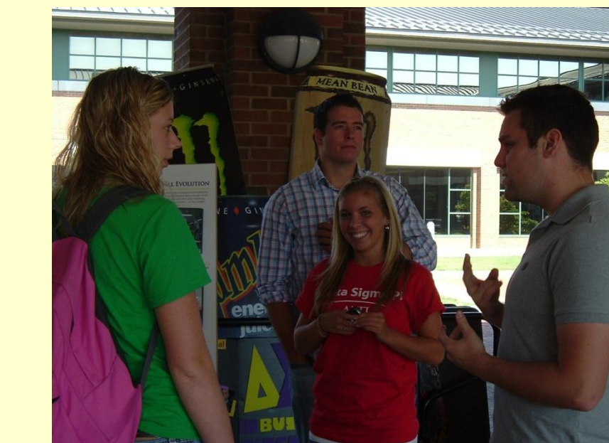
In the fall Business Bash is held outdoors in the courtyard of Schneider Hall