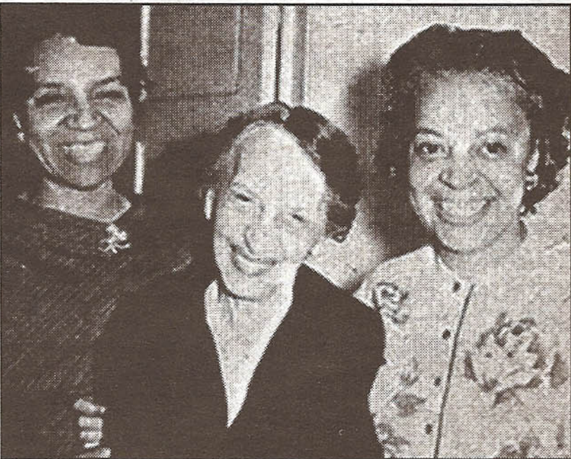
Minerva and daughters.