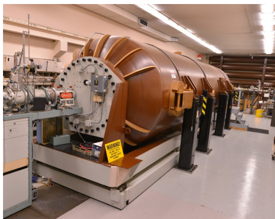
WMU's 6 Mega-Volt tandem Van de Graaff particle accelerator has two ion sources, a pelletron charging system and serves four beam lines.

Department of Physics Western Michigan University 1903 W. Michigan Ave. Kalamazoo, MI 49008-5252