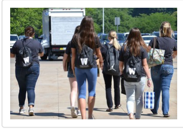
Students displaying WMU CEHD swag