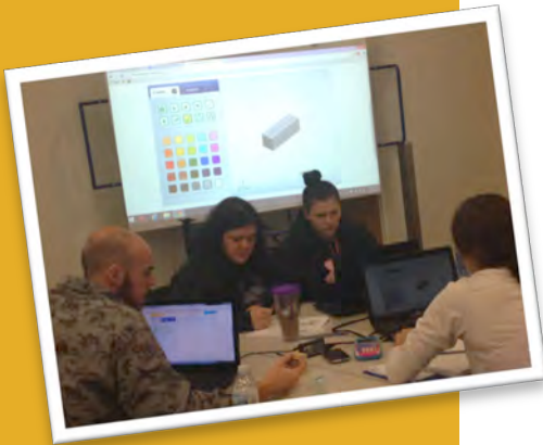
Interactive white board in a Probability and Statistics class for preservice teachers

Even if not using the IWB feature, simply having the multiple displays during class is very useful for both the instructor and the students, as multiple views of student thinking can be displayed through the many projection systems and can be used as a vehicle for whole-class discussion. When you make your next visit to Western's campus, be sure to check out the new Sangren Hall, especially room 1310!