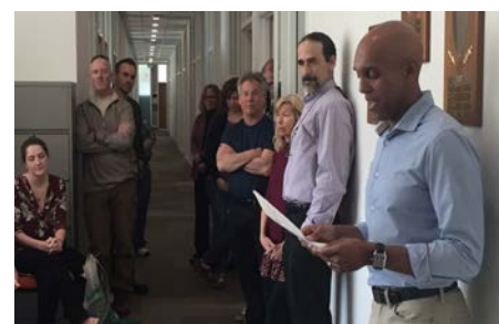
Alpha Phi Sigma Induction (Criminal Justice National Honor Society) 2016-2017