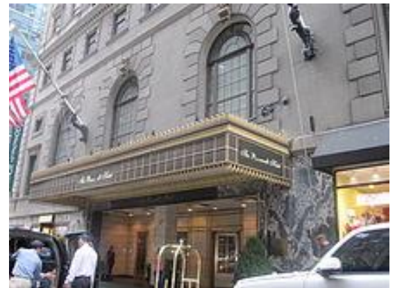
The Roosevelt Hotel, NY