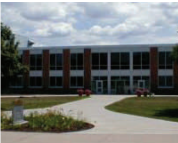
The Community & Regional Planning Major is located in the Geography Department in Wood Hall.

Michigan lies in the heart of the Great Lakes Region, one of the wonders of the world. The Great Lakes possess one-fifth of the world's surface fresh water. Michigan is a good "laboratory" for tourism, environmental, and regional planning, with many small (1-4 person) urban and regional planning departments.