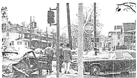
Snow time is accident time, watch your driving over the holidays.

Further information will be available to students from the campus radio station as soon as the Christmas vacation ends.