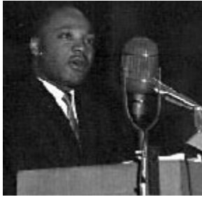
Dr. Martin Luther King, Jr.