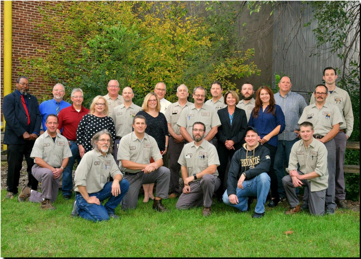
Robert M Beam Power Plant Employees, MSEA and WMU Negotiating Team at Contract Signing October 18, 2016