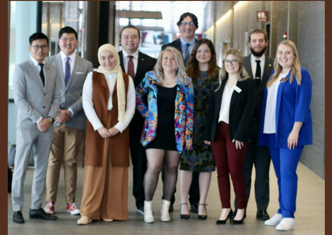
MI Student Body President Council