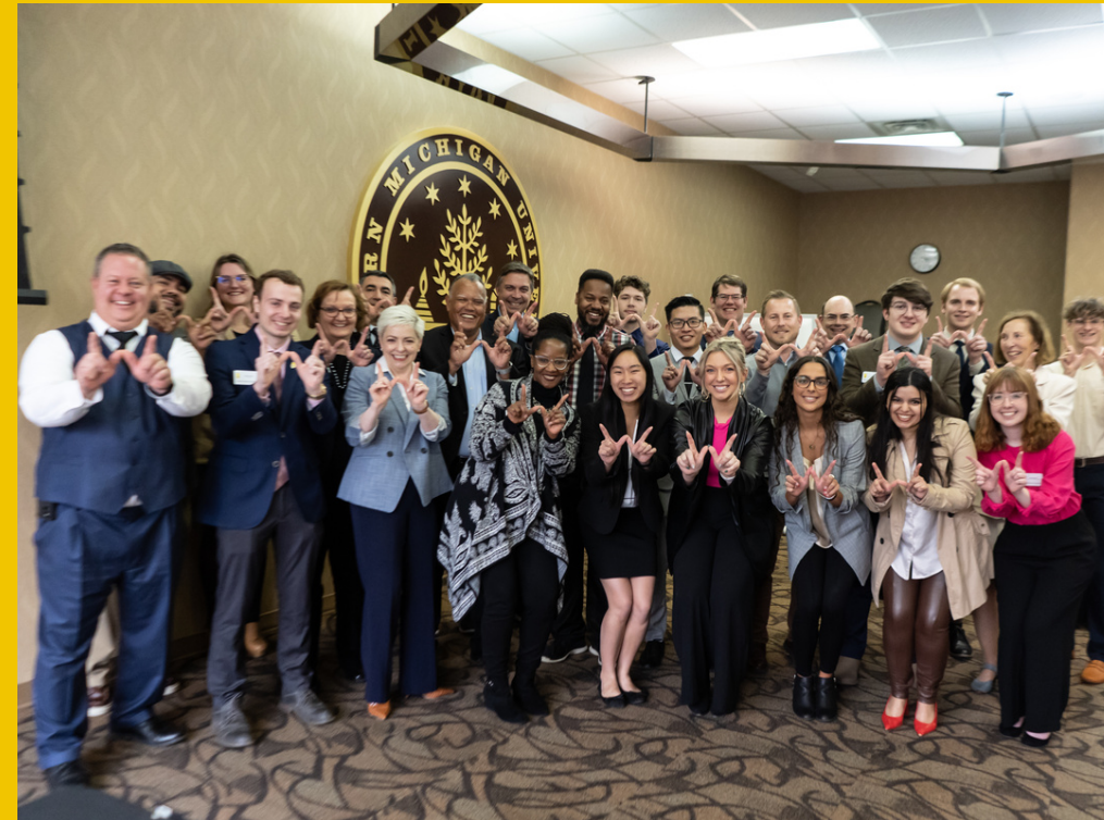
Spring 2023 Joint Cabinet