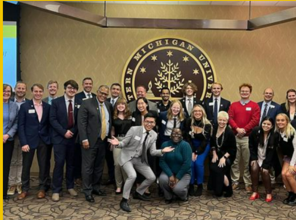
Fall 2022 Joint Cabinet