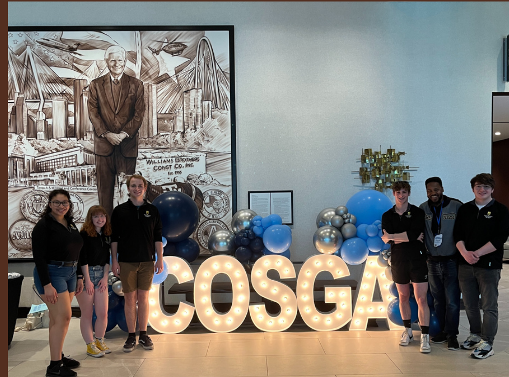
COSGA Conference @ Texas A&M