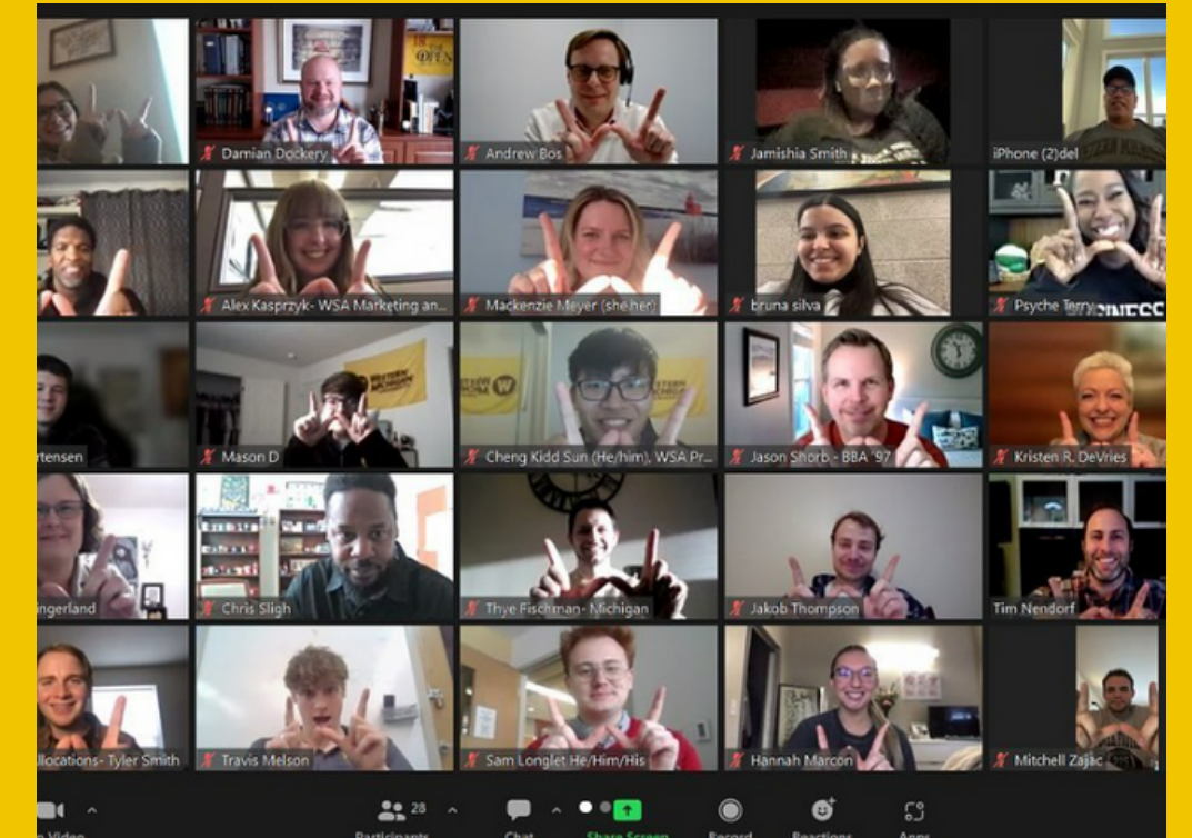
Spring 2023 Joint WSA/Alumni