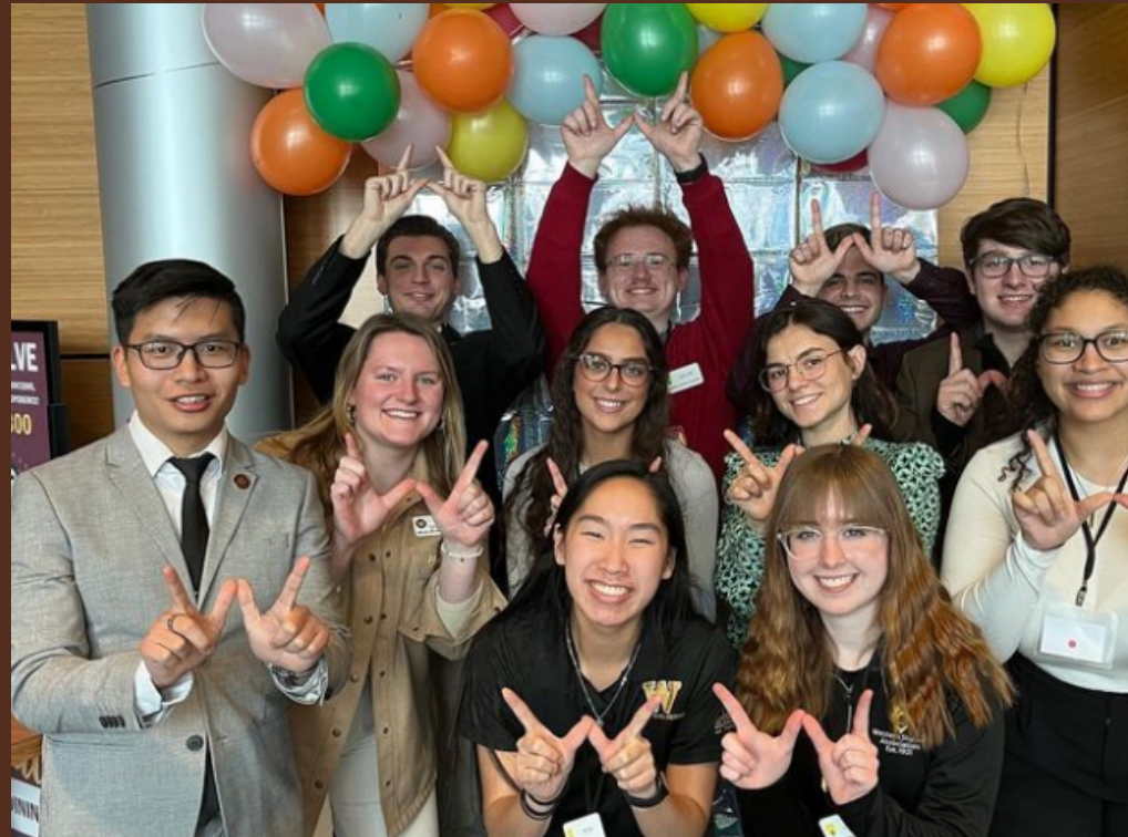
MI Student Government Conference @CMU