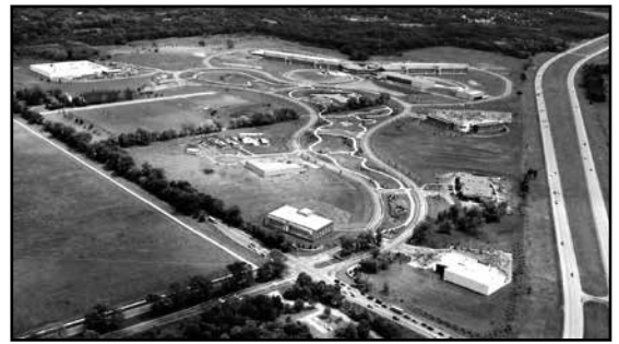
Aerial view of the BTR Park

"This development, along with the upcoming construction of a new corporate headquarters for the design firm mophie, means