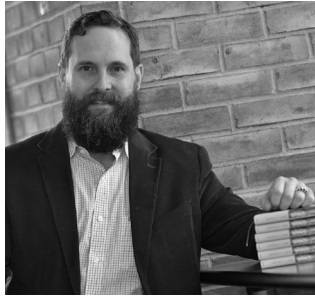
Angles

In subsequent months, he won three additional prizes, all for his work translating Japanese literature.