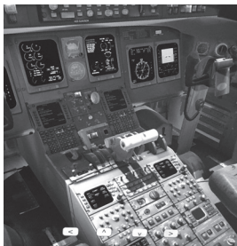
With HoloLens, students interact with 3D cockpits.

Microsoft HoloLens enables users to engage with 3D holographic content and blend it into the physical world, giving holograms real-world context and scale. With the technology, students in WMU's College of Aviation can be immersed, for instance, inside jet turbine engines or interact with 3D cockpits to learn and practice real-world aviation scenarios and procedures.