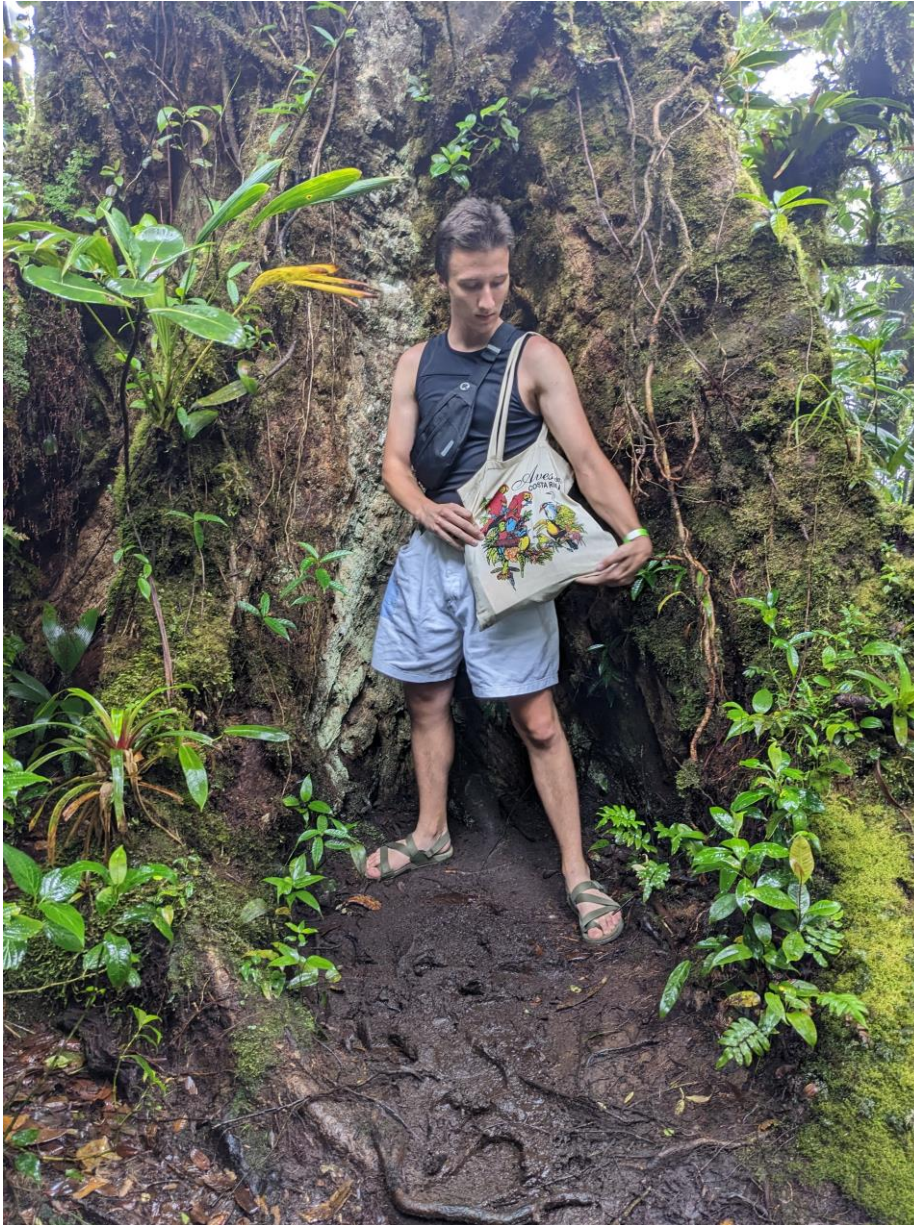
Costa Rica 2023