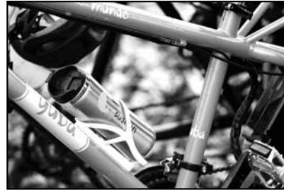
Bikes and EcoMugs are two reasons WMU was named a climate award finalist.

WMU is one of four schools in its category for national honors in the awards program. The program is sponsored by Second Nature, a national nonprofit that seeks to create a sustainable society by transforming higher education, and Planet Forward, a Web-to-TV initiative that documents and shares energy, climate and sustainability advances that can be used to tackle some of society's