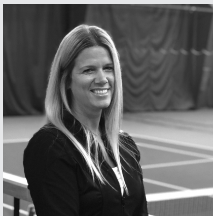
FITTING POSITION

The way people exercise, who they exercise with and even the ease by which they can choose their activities has changed significantly since Amy Dominguez was a student employee at West Hills Athletic Club in the late 1990s.