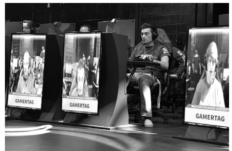
Esports club members played for the public and cameras Oct. 5.