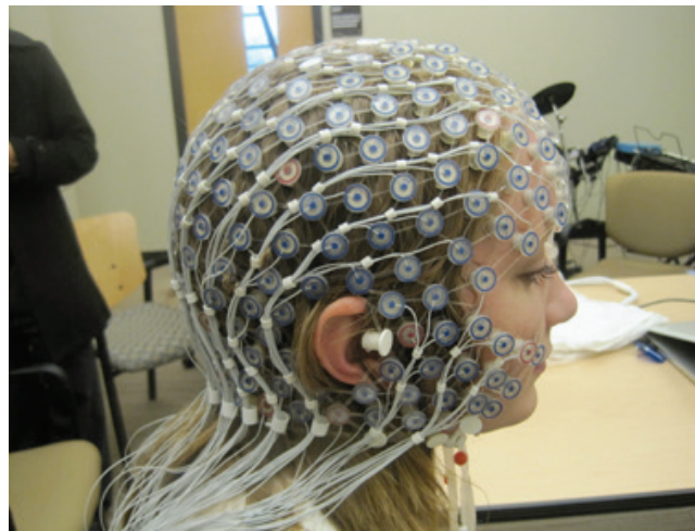
An electroencephalography cap is a tool used by researchers and in medicine to detect electrical activity in the brain.

"So jazz musicians have this perfect storm of neural activity related to uninhibited self expression," Roth says.