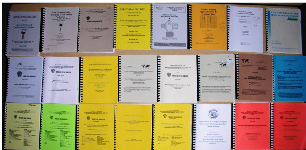
MGRRE - Petroleum Technology Transfer Council (PTTC) Manuals prepared and used in conferences conducted since 1997 to 2014.