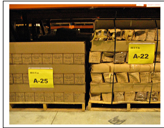
Damaged core in boxes is repackaged and catalogued at MGRRE using NGGDPP funds.