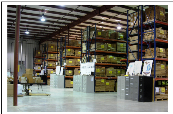
The MGRRE core facility storage, examination & technical workshop areas. (>27,000 sq ft.)