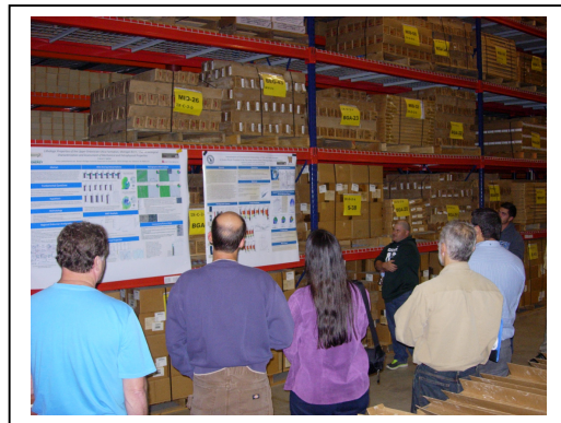
Core workshops with student poster sessions showcase Thesis project work