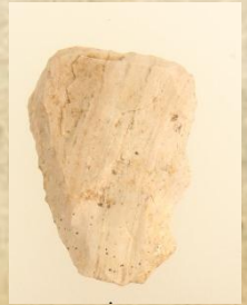
This stone hide scraper was found at Fort St. Joseph.