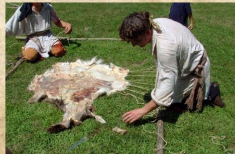
Hides were scraped clean and then stretched to dry on frames.