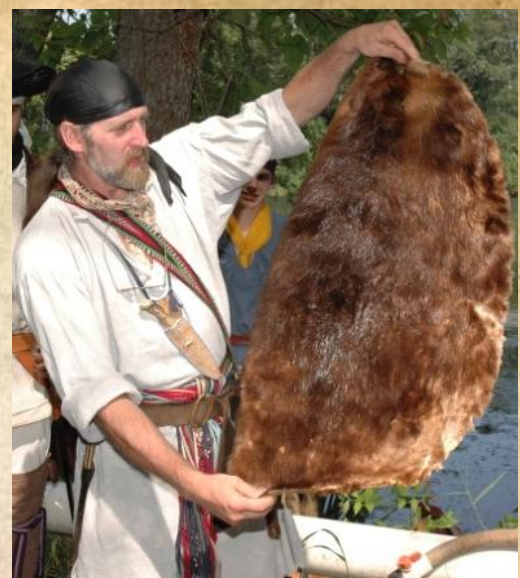
Castor sec, also known as parchment beaver to English speakers.

Traders baled pelts into packs for transport to Montreal and then transshipment to La Rochelle, France. In France the fur was processed and made into felt for use in making fashionable hats. With the introduction of silk hats in the 1840s, felt hats went out of fashion and the beaver fur trade slowly went into decline.