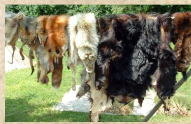
Other furs such as marten, fox, otter and mink were also traded, but beaver was the mainstay of the trade.