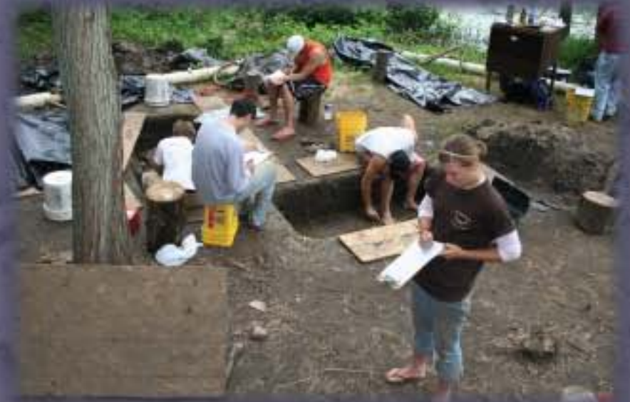
WMU archaeologists today at the site.

albeit beneath the ground water table, complicating excavations.