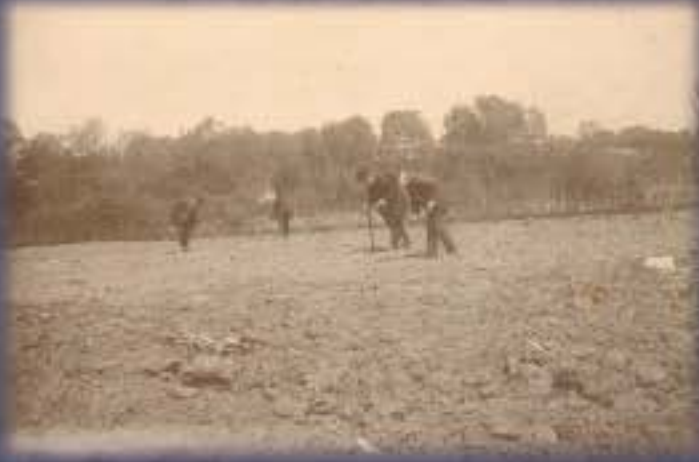
Local historians collect artifacts from Fort St. Joseph.

Investigations at the long lost fort were begun in 1998 by WMU archaeologists.