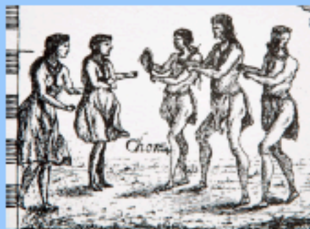
Native Americans trading, from a 1657 map of New France

"Three women came here from the Stinnekens [Iroquois] with some dried and fresh salmon...They sold each salmon for one gulder or two hands of sawant [wampum]. They also brought much green tobacco to sell" – Van den Bogaert, 1636