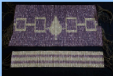
Iroquois wampum belts