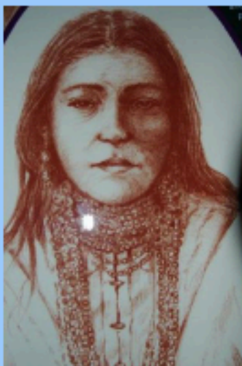
Modern artist's conception of Madame Montour

Native American and European cultural mediators known as "go-betweens" traveled the woods to carry messages and negotiate compromises as representatives of their respective cultures. While much of the literature focuses on the contributions of men as intercultural diplomats, recent scholarship points to the presence of several women in New France who shaped Indigenous-colonial interactions. Women did in fact translate documents and carry messages to help maintain peace and build diplomatic bridges between cultures.