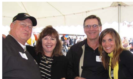
Alumni Society Board Members and guests at CommUniverCity - Annual Alumni Event

Western Michigan University does not discriminate on the basis of race, color, age, religion, national origin, sexual orientation, gender identity, sex, marital status, disability, or status as a U.S. veteran.