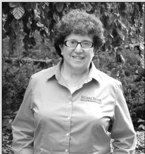
CENTERED ON EVENT PLANNING