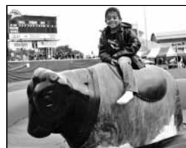
WMU's first Corral proved entertaining for attendees.

The Corral Entertainment Village, which made its debut Sept. 17 prior to the Central Michigan University football game, will return from 10 a.m. to 1:45 p.m. Saturday, Oct. 8, in the Robert J. Bobb baseball stadium and fire up fans for the 2 p.m. football contest against Bowling Green State University.