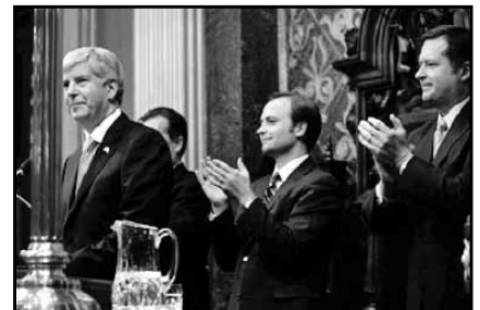
Gov. Rick Snyder, left, giving his State of the State address.