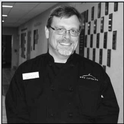
PLENTY ON HIS PLATE