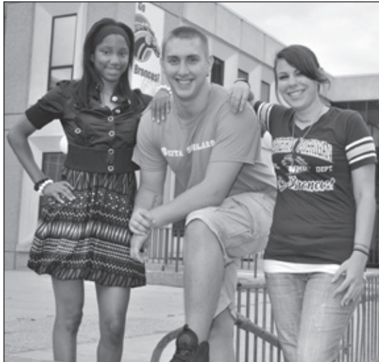
These Seita Scholars, as well as this fall's incoming scholars, are benefiting from state support for WMU's Foster Youth and Higher Education initiative.

The Michigan House and Senate conference committee also settled on budget