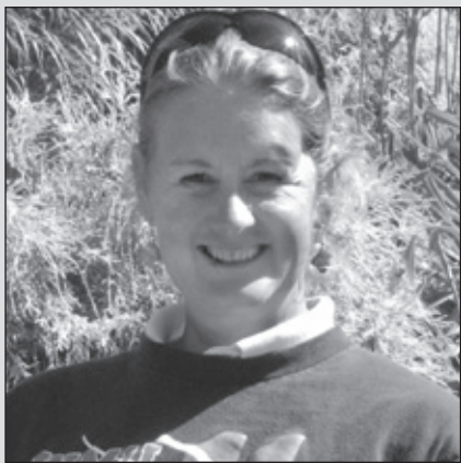
MAKING CAMPUS LOOK GOOD