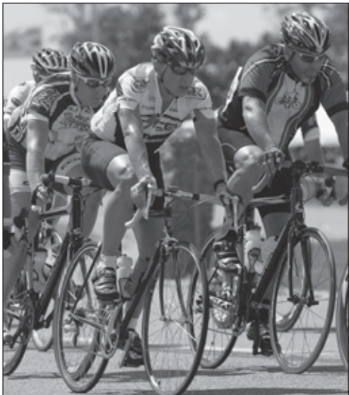
Miller Energy Criterium

Online registration ends at 11:59 p.m. Thursday, July 11. Race-day registration will open at 6:30 a.m. on site in the Southwest Michigan Innovation Center and close 30 minutes prior